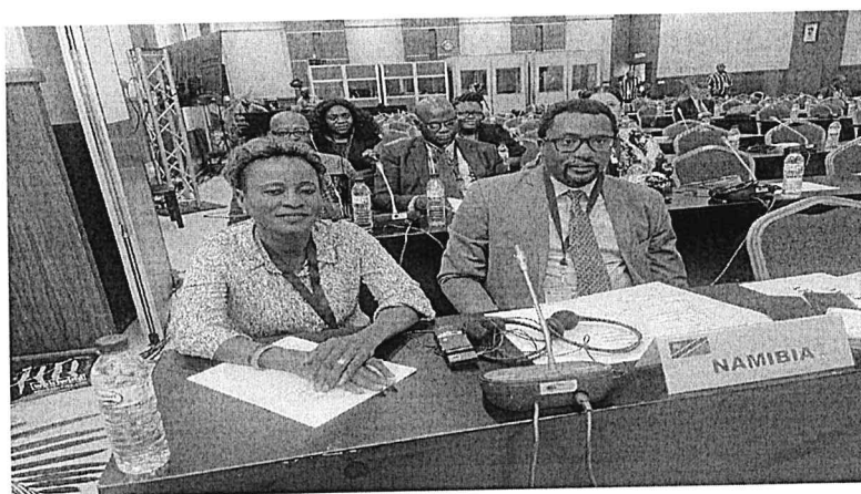
Namibian delegation attending the meeting of the Bureau of the ACP-EU JPA