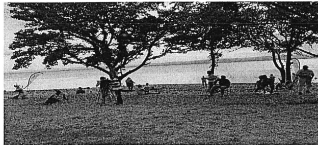
the limbos Dam in the Boane District, outside Maputo