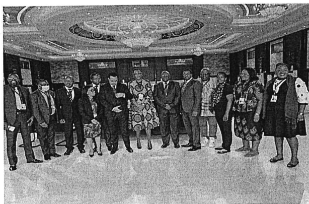
Southern Africa Members posing for a picture after the meeting