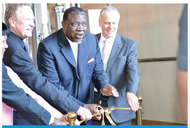
Official inauguration of NBL plant (2nd from right - Dr. Hage Geingob)