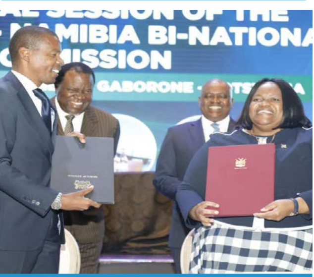
Dr. Hage G. Geingob and H.E Mokgweetsi Masisi looking on as the respective Ministers of Trade of Namibia and Botswana sign an MoU.