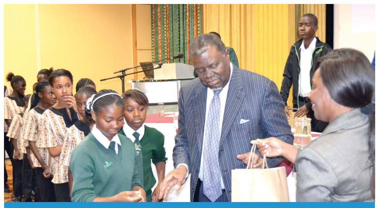
Learner receiving gifts from Hon. Minister during African child's day celebration