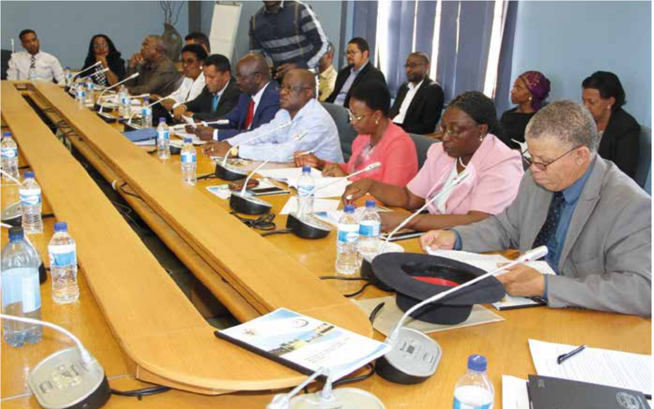
The Parliamentary standing committee on Public Accounts holding a public hearing