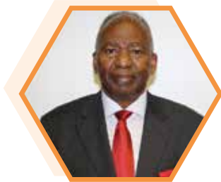
Hon Prof Peter H Katjavivi Speaker, MP