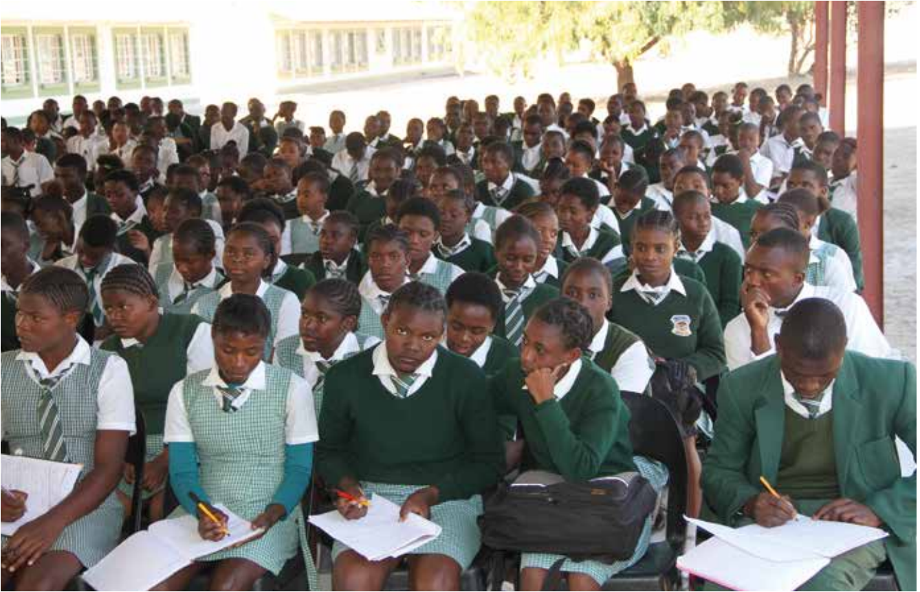
Learners listen attentively during one of the public education engagements on the functions of parliament