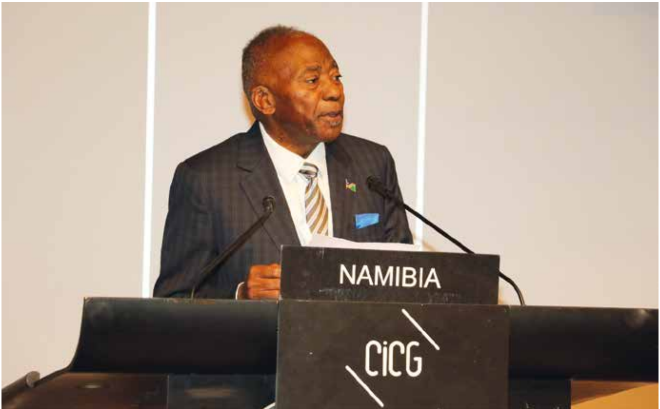
Speaker of the National Assembly, Professor Peter Katjavivi participates in the general debate at the 139th IPU General Assembly