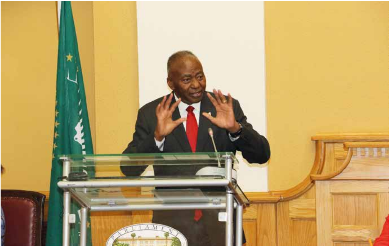
Hon Prof Peter Katjavivi officially opening the expert meeting on production of resource material on national liberation movements in the SADC Region at the Parliament