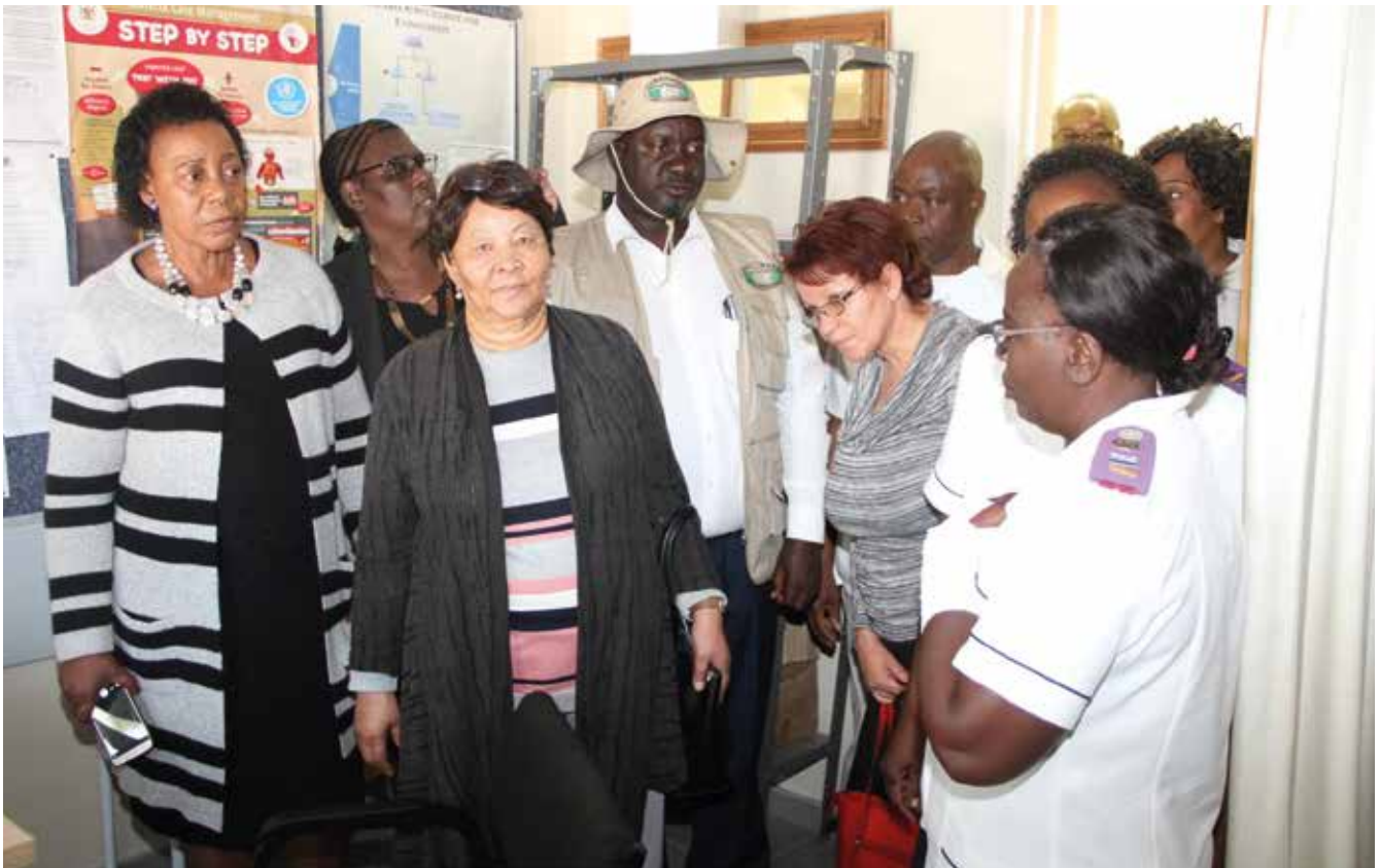
Members of Parliament from the Standing Committee on Gender Equality, Social Development and Family Affairs inspect a clinic during their oversight activities in the two regions of Omusati and Oshana