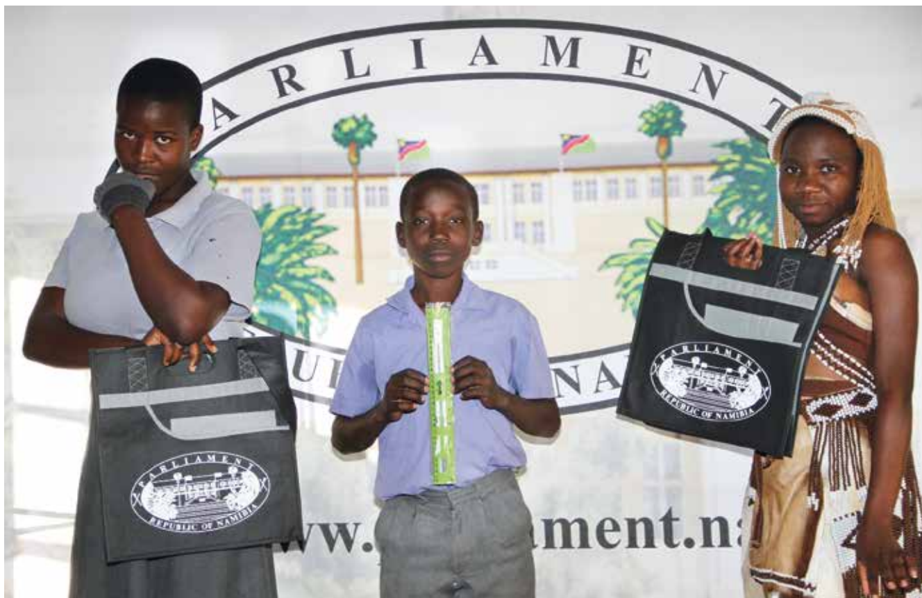
Learners with gifts from parliament - as part of the outreach