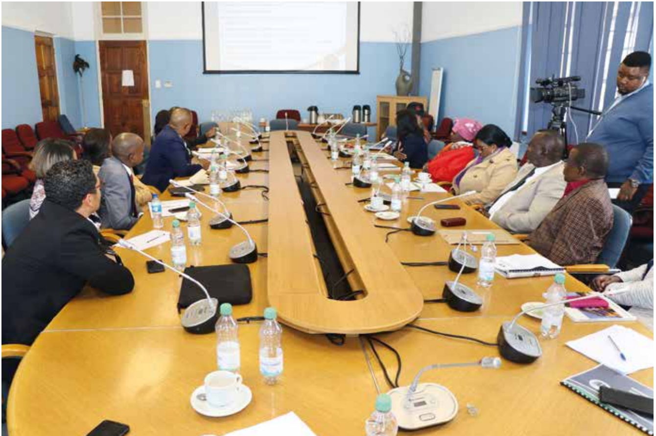
The Parliamentary Standing Committee on Economics and Public Administration in a consultative meeting as part of the oversight function