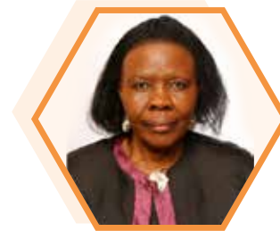
Hon Loide Kasingo Deputy Speaker, MP