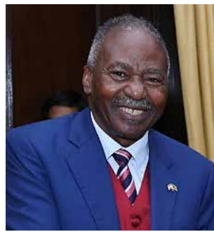
Hon. Prof. Peter H. Katjavivi, MP SPEAKER