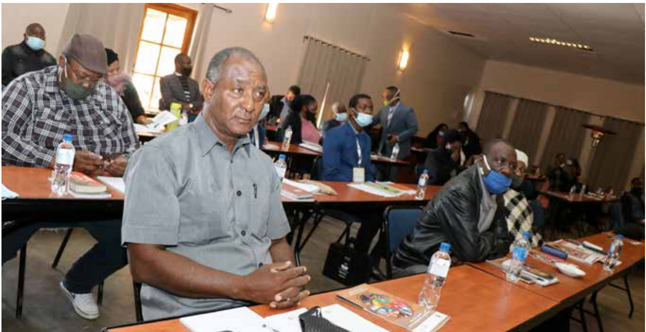
Members of Parliament at the official opening of the SRHR workshop

The committee did not table reports in the National Assembly.