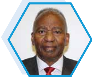
Hon Prof Peter H Katjavivi Speaker MP