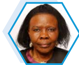
Hon Prof Loide Kasingo Deputy Speaker MP