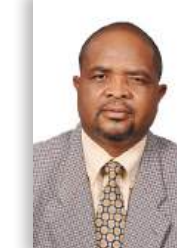
HON. D. KUUOKO Epupa Constituency