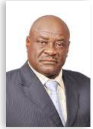
HON. P. NDJAMBULA Olukonda Constituency