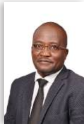
HON. J. !HAOSEB Daures Constituency