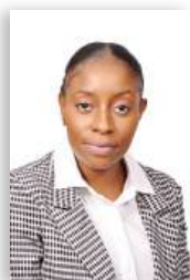
HON. E. MUTEKA Windhoek West Constituency