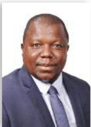
HON. U. NGUNAIHE Opuwo Urban Constituency