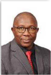
HON. S. !GOBS Khorixas Constituency