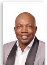
HON. P. MBANGU Rundu Rural Constituency