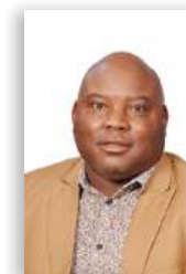
HON. P. KAZONGOMINJA Aminius Constituency