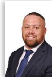
HON. A. BENSON Walvis Bay Constituency