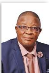
HON. P. ISAAK Gibeon Constituency