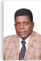
HON. L. SHIKULO Okahao Constituency