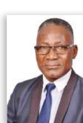
HON. S. NANGULA Onankali Constituency