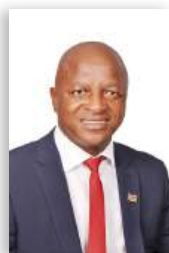
HON. H. NAMBODI Okankolo Constituency