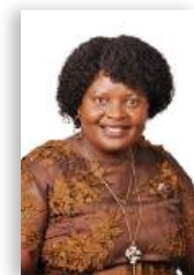
HON. O. HANGHUWO Eenhana Constituency