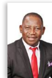
HON. E. HAINGHUMBI Engela Constituency