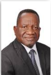
HON. A. SHIKONGO Oshakati East Constituency