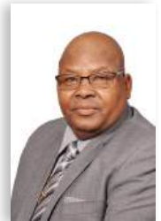
HON. N. MOTINGA Daweb Constituency