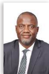
HON. G. GARAB Otavi Constituency