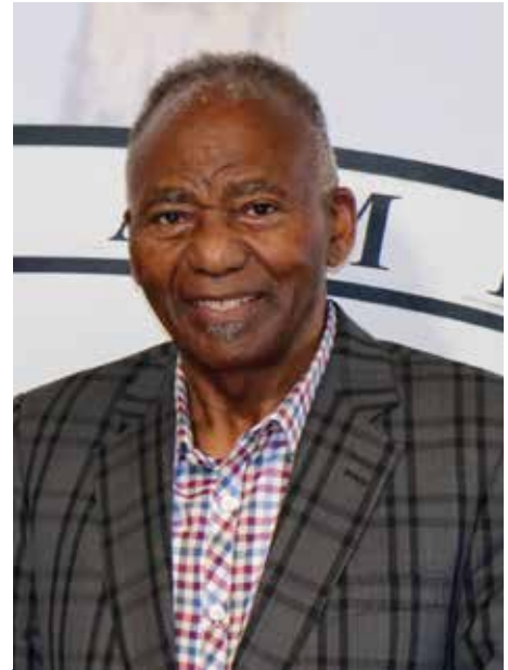
Hon. Prof. Peter H. Katjavivi, MP SPEAKER

Our General Services Division plays a facilitator auxiliary role to the overall activities of the National Assembly. We have tirelessly continued to try to open avenues which could provide training in critical areas. These are areas which are unique to Parliament and which are vital and instrumental to the smooth and vibrant functioning of Parliament. We partook in various programmes mounted by parliamentary partner institutions. On the issue of drivers, it is high time that efforts are made to acquire an adequate number of drivers so that the institution is properly catered for. On the aspect of procurement, this has continued to present a particular challenge ever since new procurement guidelines were instituted. The new guidelines were introduced before adequate preparation was done. It seems like in the immediate to midterm, it has created more bottlenecks than it has been able to solve. Despite this difficult situation, we remain hopeful that we shall forge a meaningful way forward. On the structural safety of our Parliamentary Building, it is obvious that it is ageing and therefore requires major maintenance works. It is vital that the National Assembly will have to annually budget for this vital exercise of maintenance and security. On staff recruitment, efforts were made to ensure that vacant