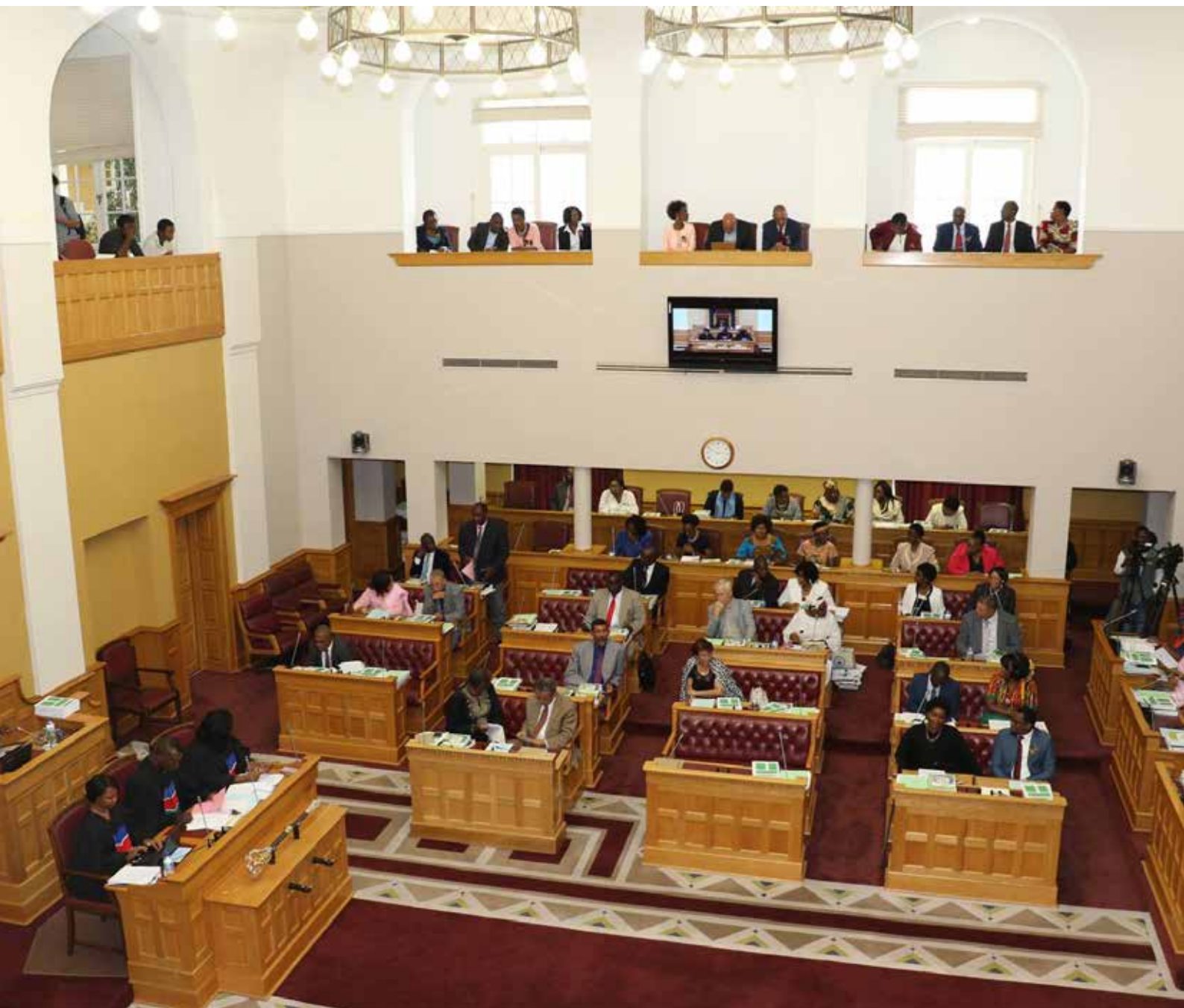
National Assembly during one of its sessions