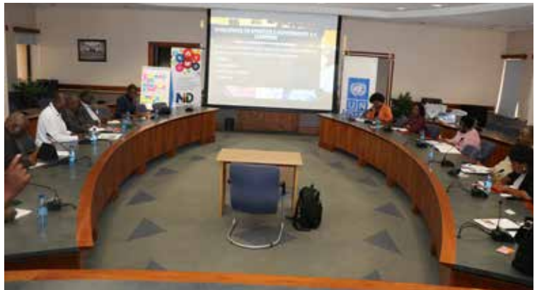
Members of Parliament belonging to the ICT Committee attending a training on digital democracy

The Standing Committee On Information, Communication, Technology And Innovation monitor, enquire into, and make recommendations to the National Assembly on matters that may directly or indirectly affect Information and Communication Technology, Science, Research and Technology, and Consider issues relating to the rollout and use of ICTs throughout the country from an elected representative's point