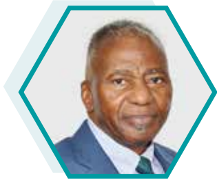
Hon Prof Peter H Katjavivi Speaker, MP