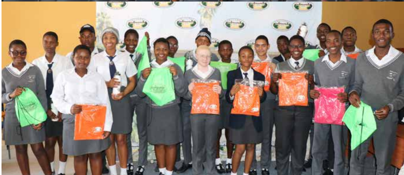
The National Assembly conducted a school outreach programme and visited various schools in the Erongo and Oshikoto regions