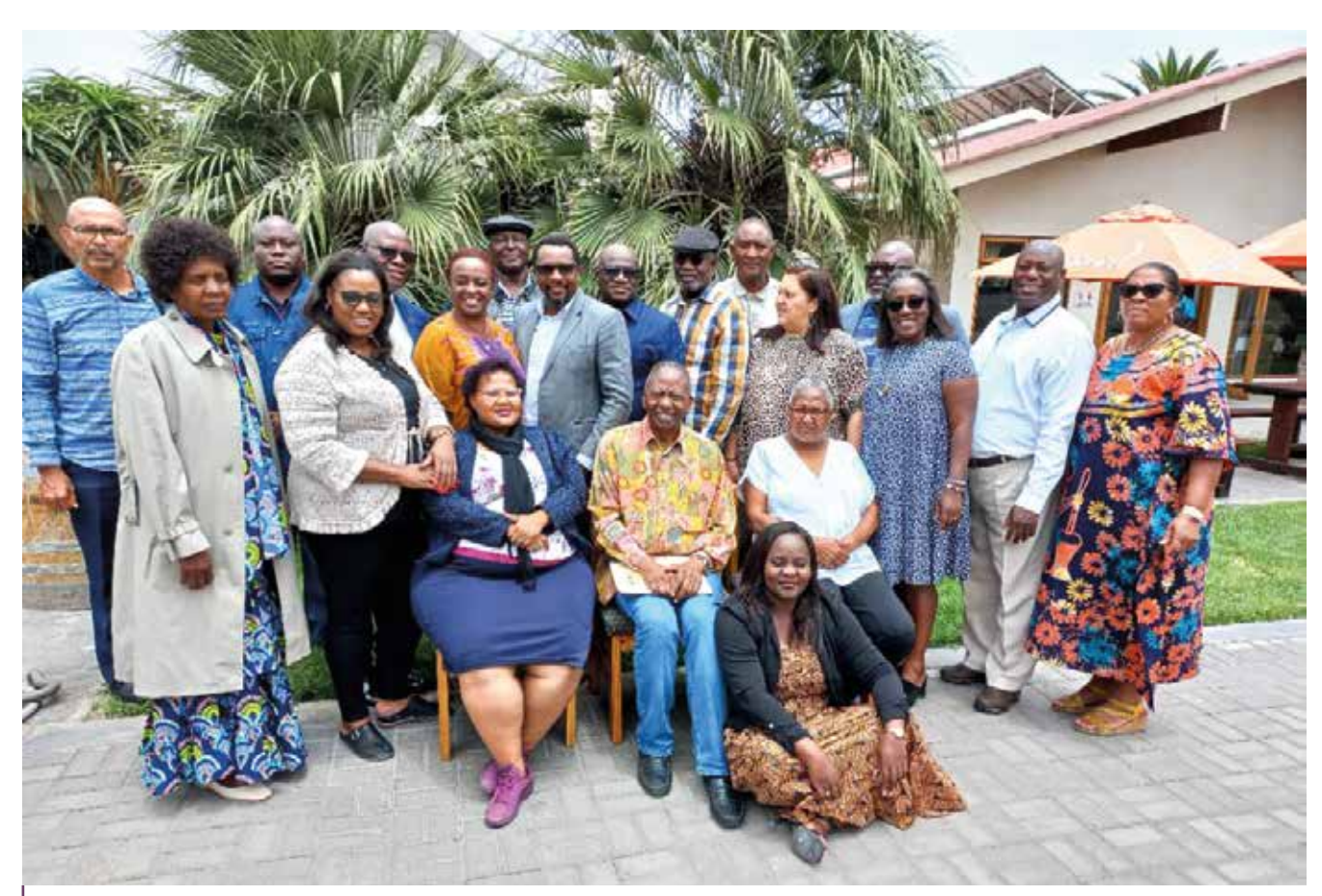
Speaker of the National Assembly Hon. Prof Peter Katjavivi together with members of Parliament who formed part of the team that participated in the review workshop of the Standing Rules and Orders and Internal Arrangements of the National Assembly in Swakopmund.