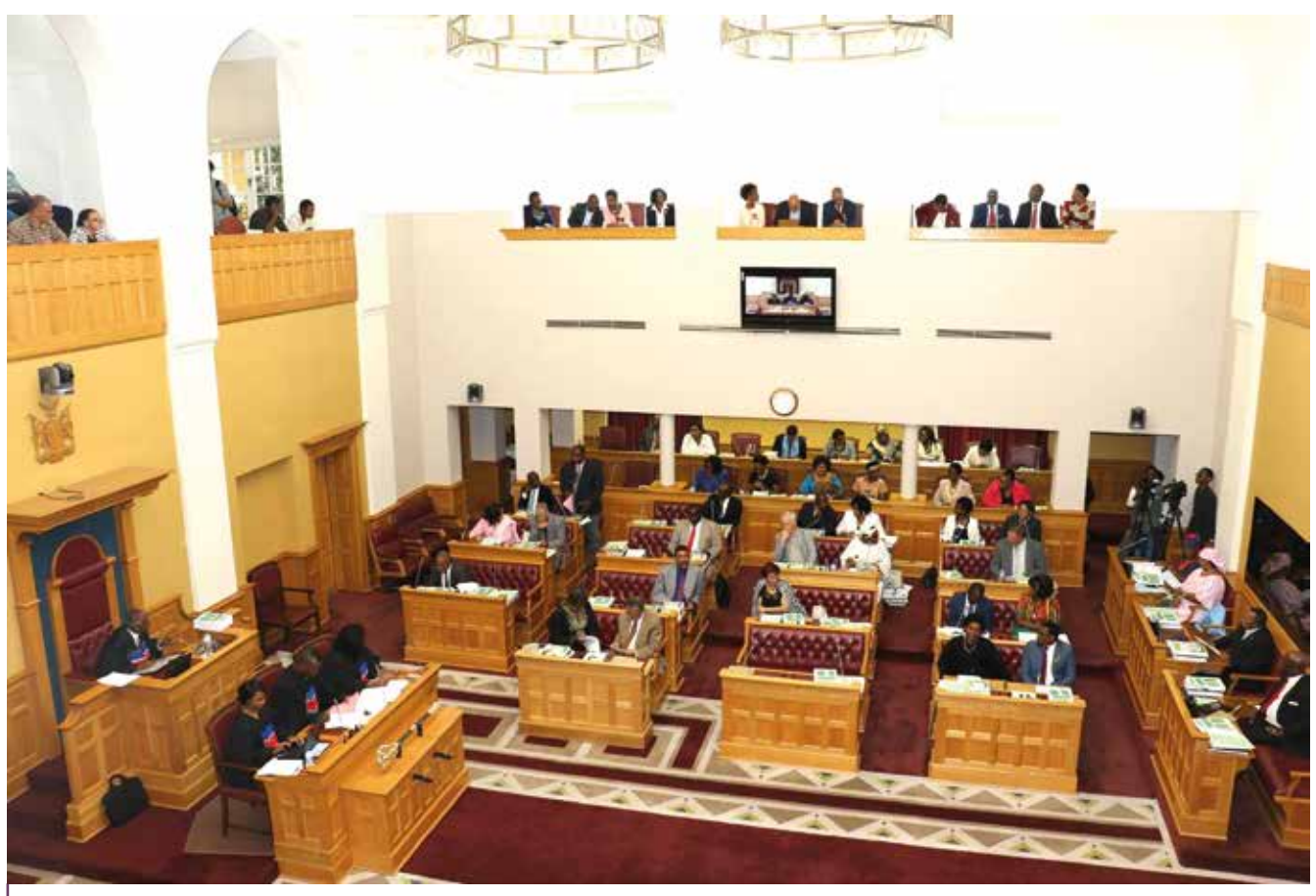
The National Assembly during one of it's sessions