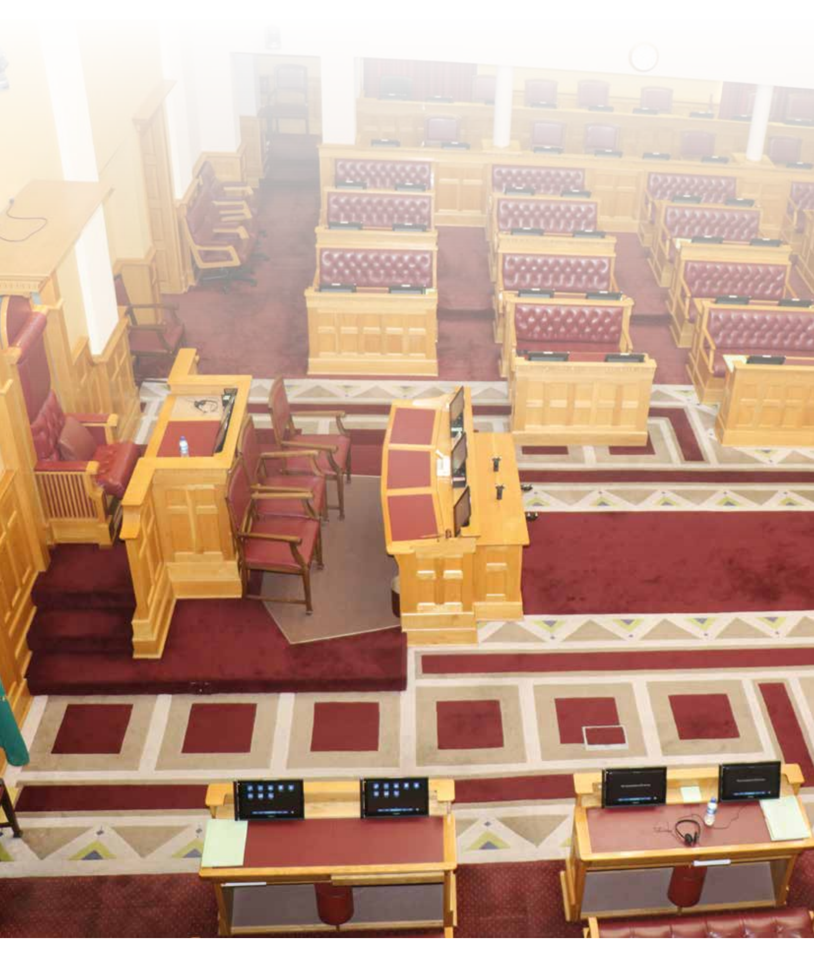
Inside the Chamber of the National Assembly