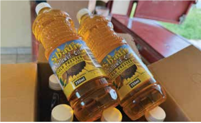
Cold pressed Sunflower Oil form Shadi Kongoro Green Scheme