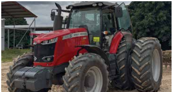
Newly procured state of the art tractors for the green schemes