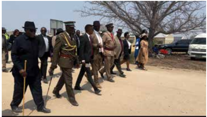
Welcoming ceremony of the Batswana of Namibian descent at Dobe Boarder Post