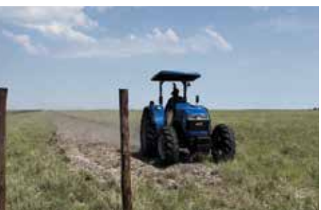
DCCP tractor ploughing a field in Okatyali Constituency