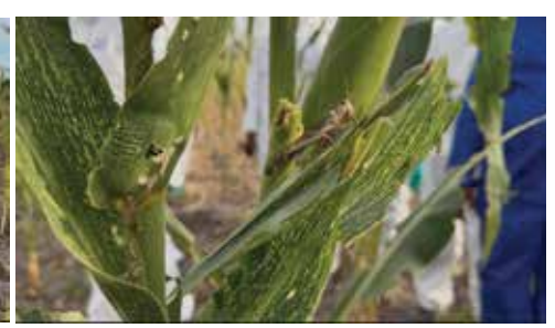
Maize field destroyed by fall armyworm and locast in Zambezi Region

5. Honourable Members, it is well known that Namibia holds the distinction of being the driest country in Sub-Saharan Africa. This unfortunate climatic condition renders our nation susceptible to the effects of climate change and variability. As a result, a critical sector such as agriculture, is increasingly exposed to climate-related natural disasters including droughts and floods that are not only occurring more frequently but are also growing in intensity. The agriculture sector, in particular, bears the effect of these impacts, as it supports directly or indirectly the livelihoods of approximately 70 percent of the Namibian population. The effects of climate change have, regrettably, become a persistent and defining feature of our national reality. This remains a serious concern for the Government, particularly given that erratic rainfall patterns resulting from these adverse climatic conditions disrupt the effective implementation of agricultural production programmes, such as the Dry-Land Crop Production Programme, which rely entirely on seasonal rainfall. Consequently, these unfavourable conditions undermine our capacity to enhance food production, thereby limiting our ability to ensure national food security and hindering progress toward achieving our national goal of food self-sufficiency.