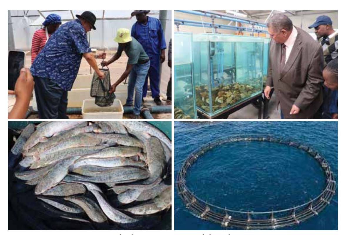
Former Minister Hon. Derek Classen visiting Epalela Fish Farm in Omusati Region