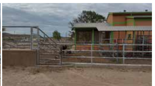
Opuwo slaughterhouse to be upgraded to a C-class abattoir