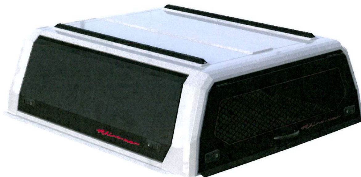
Sample Rhinoman Alu Canopy ( Glassy at the back and Solid on the sides )