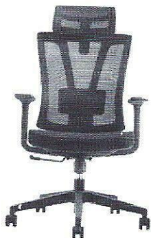
Figure 1: C4005 –Mesh High back chair