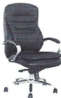
Figure 2: Luvitt High back, Black genuine leather chair

Procurement Reference Number: G/RFQ/03-34/25/26