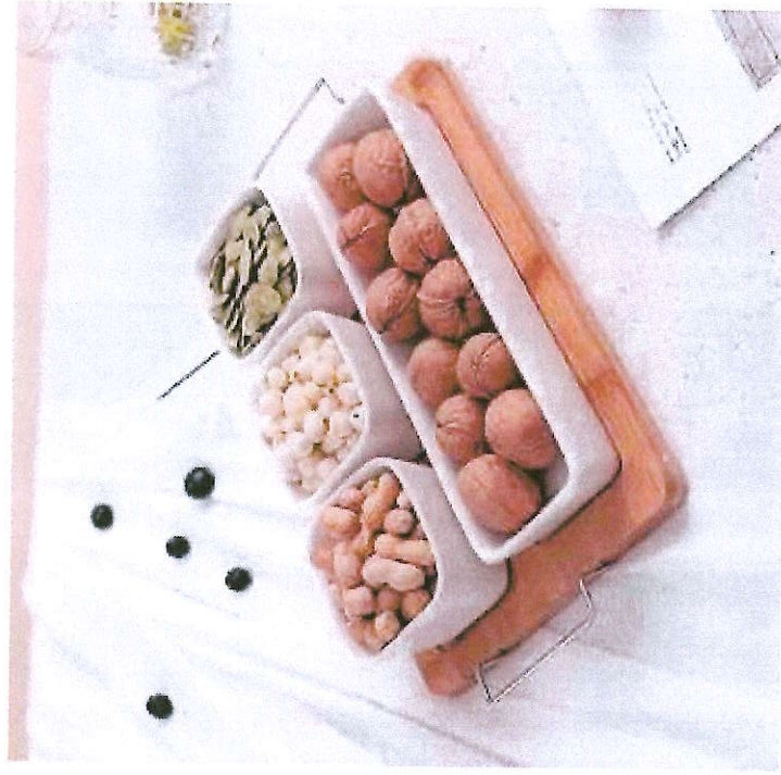
Ceramic snack serving set with a Bamboo tray